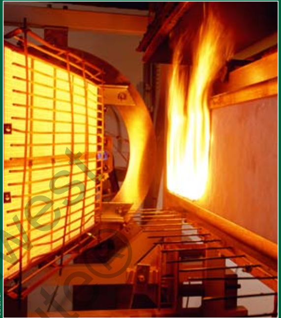
Flame spread testing per Part 5 of Annex 1 of the IMO FTP Code