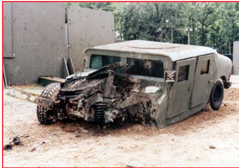
SwRI analyzed armor design and retrofits that greatly improved crew survivability against mine blast for the HMMWV.