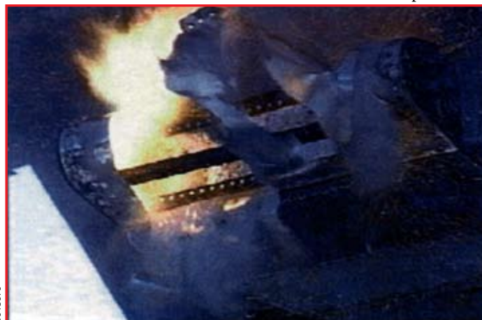
A high-explosive projectile impacted a simulated wing section containing fuel as part of a test series to validate the safety of an SwRI-designed replacement foam insert.