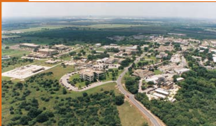
Southwest Research Institute is an independent, nonprofit, applied engineering and physical sciences research and development organization using multidisciplinary approaches to problem solving. The Institute occupies 1,200 acres in San Antonio, Texas, and provides more than 2 million square feet of laboratories, test facilities, workshops and offices for more than 3,300 employees who perform contract work for industry and government clients.

We welcome your inquiries. For additional information, please contact: