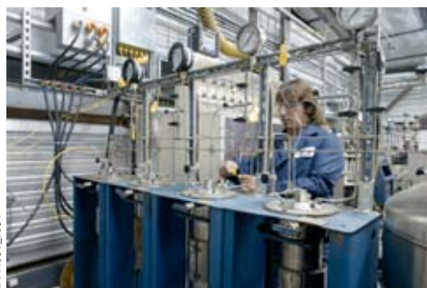
Advanced instrumentation is used for both standardized and unique specialized testing. SwRI conducts tests in the presence of high-pressure hazardous gases such as H 2 S with state-of-the-art analytical instruments.

Stress corrosion cracking (SCC) of corrosion-resistant alloys in completion brines has been a problem in several offshore production areas. SwRI is conducting a joint industry program to develop guidelines for selecting brine compositions and additives to avoid SCC. In many applications steel undergoes multiaxial loading, whereas sour gas application criteria are typically based on uniaxial tests. A program of testing under combinations of internal pressures and external stresses conducted at SwRI is helping to develop better design criteria. As wells become increasingly sour, steels with resistance to highly sour environments need to be developed. SwRI is developing correlations between sulfide stress cracking resistance, microstructure, and absorbed hydrogen using a laser thermal desorption mass spectrometry system.