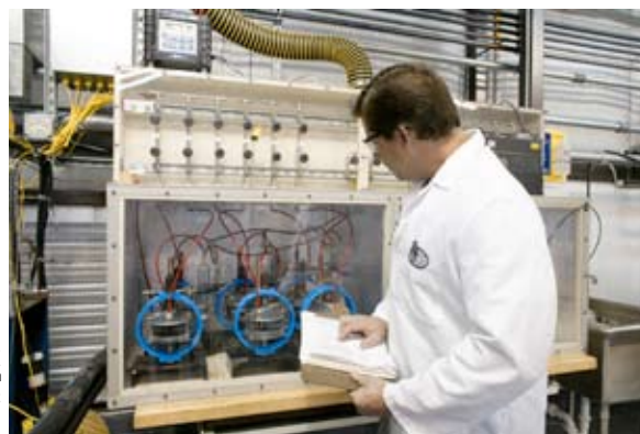
SwRI is investigating sulfide stress cracking resistance at different temperatures and under rigorous deoxygenation using a variety of test methods.