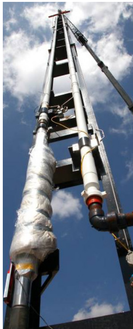
Cone meter: Testing shown under wet gas conditions