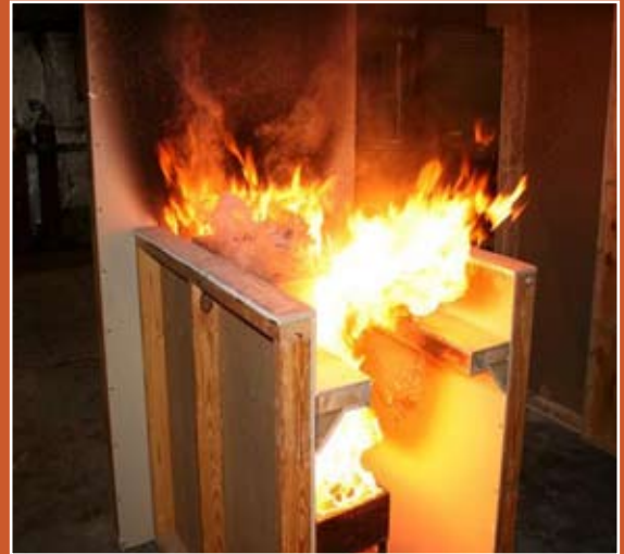
CA SFM 12-7A-4 Part A test for decking materials