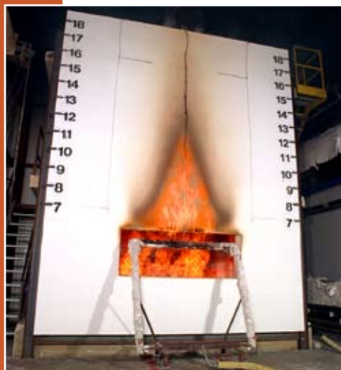
SwRI offers testing to NFPA 285 and ASTM E2307 utilizing its intermediate-scale, multi-story testing apparatus (ISMA)

SwRI has one of the few test laboratories in North America with equipment for performing NFPA 268, "Standard Test Method for Determining Ignitability of Exterior Wall Assemblies Using a Radiant Heat Energy Source," and NFPA 285, "Standard Fire Test Method for Evaluation of Fire Propagation Characteristics of Exterior Non-load-bearing Wall Assemblies Containing Combustible Components," in one location.