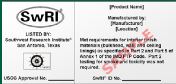
Typical SwRI label for interior surface finish materials