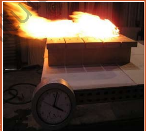
CA SFM 12-7A-4 Part B test for decking materials