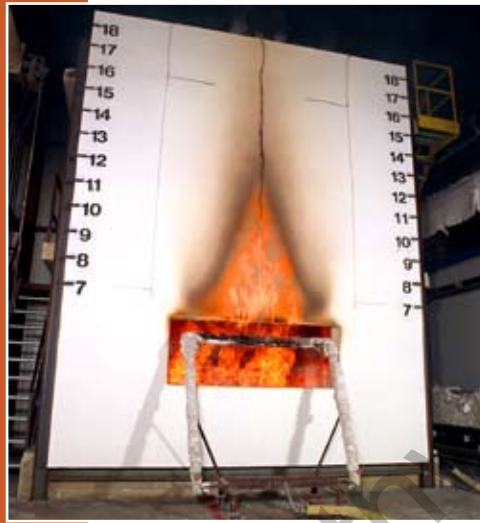
SwRI offers testing to NFFPA 285 and ASTM E2307 utilizing its intermediate-scale, multi-story testing apparatus (ISMA)

SwRI has one of the few test laboratories in North America with equipment for performing NFFPA 268, "Standard Test Method for Determining Ignitability of Exterior Wall Assemblies Using a Radiant Heat Energy Source," and NFFPA 285, "Standard Fire Test Method for Evaluation of Fire Propagation Characteristics of Exterior Non-load-bearing Wall Assemblies Containing Combustible Components," in one location.