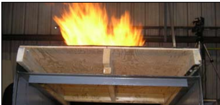
ASTM E108 (UL 790) test for roofing materials

SwRI has worked with the California State Fire Marshal (CA SFM), ASTM E05 and E14 subcommittees, and various commercial clients to promote the understanding of wildland-urban interface fires. These fires, typically characterized by quick spread due to ignition of dried vegetation, have plagued homeowners and insurance agencies for decades. As new standards are developed with fire exposures representative of actual forest fires, the risk of both property and life loss is greatly reduced.