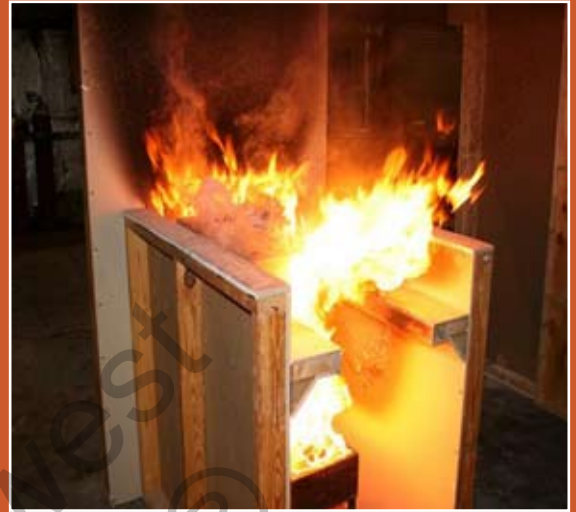
CA SFM 12-7A-4 Part A test for decking materials