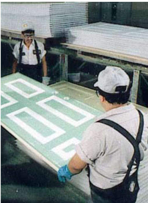
Manufacturing and field inspections