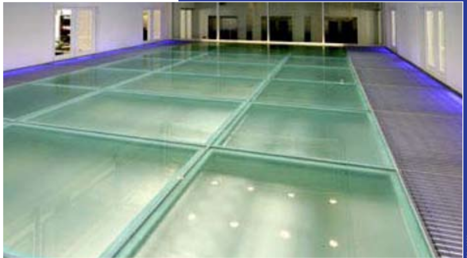
SwRI listed and labeled floor/ceiling assembly