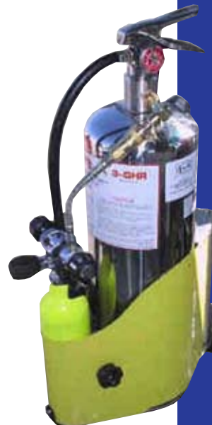
Fire extinguisher in SwRI's Listing and Labeling Program