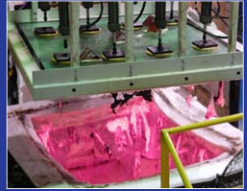
Fire resistance test of floor/ceiling assembly