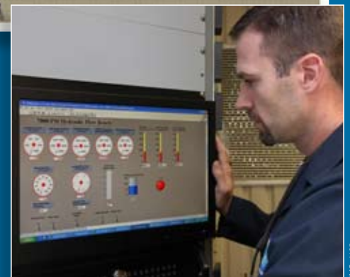
SwRI engineers routinely conduct tests that verify the operation of commercial, prototype and SwRI-developed hydraulic components.