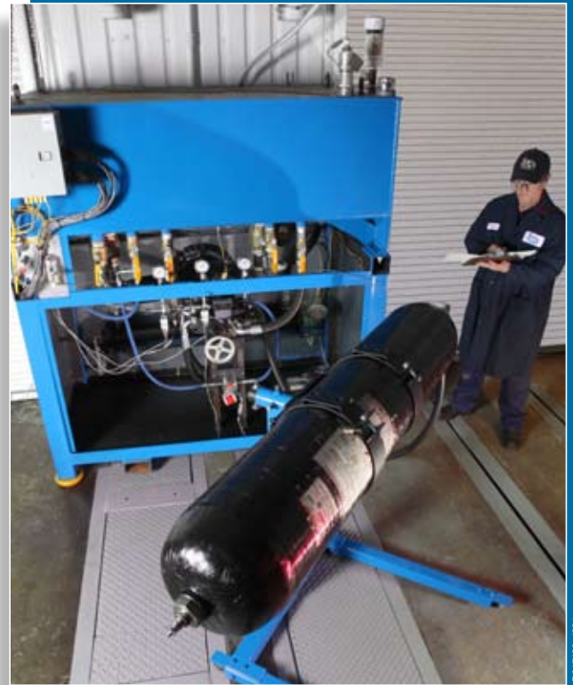
SwRI staff perform evaluation and analysis of lightweight composite hydraulic accumulators for use in hydraulic hybrid vehicles.