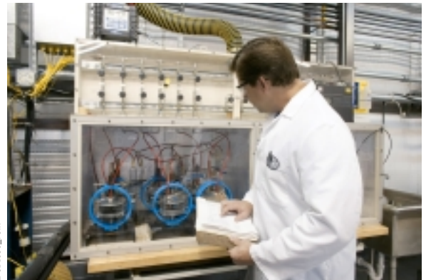
SwRI is investigating sulfide stress cracking resistance at different temperatures and under rigorous deoxygenation using a variety of test methods.