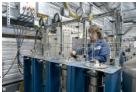
Advanced instrumentation is used for both standardized and unique specialized testing. SwRI conducts tests in the presence of high-pressure hazardous gases such as H 2 S with state-of-the-art analytical instruments.

Stress corrosion cracking (SCC) of corrosion-resistant alloys in completion brines has been a problem in several offshore production areas. SwRI is conducting a joint industry program to develop guidelines for selecting brine compositions and additives to avoid SCC. In many applications steel undergoes multiaxial loading, whereas sour gas application criteria are typically based on uniaxial tests. A program of testing under combinations of internal pressures and external stresses conducted at SwRI is helping to develop better design criteria. As wells become increasingly sour, steels with resistance to highly sour environments need to be developed. SwRI is developing correlations between sulfide stress cracking resistance, microstructure, and absorbed hydrogen using a laser thermal desorption mass spectrometry system.