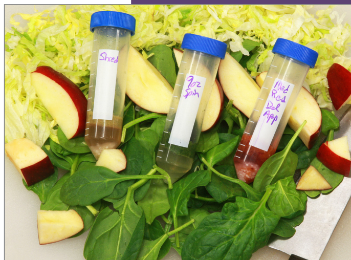
The SwRI food chemistry laboratory uses solid-phase extraction techniques that allow for sample extraction and interferent clean-up in fewer steps and with shorter turnaround times.