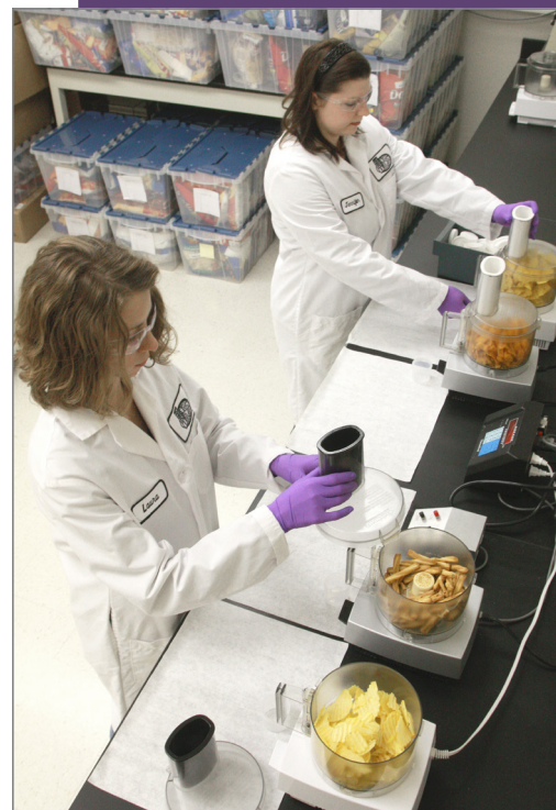
Chemical analysis of food samples begins with the use of household blenders to reduce foods to fine particles whose chemical components can be extracted for quick and consistent screening and analysis.