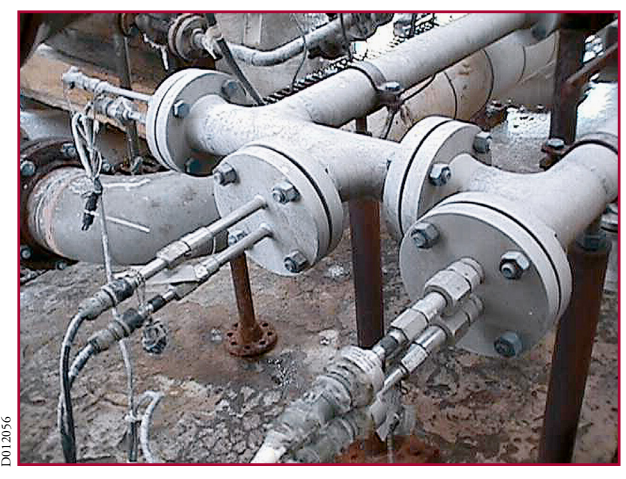
SwRI developed and implemented multi-electrode array sensor (MAS) probes to monitor localized corrosion of chemical process system components in real time.

SwRI developed a corrosion database in various acid mixtures for the Materials Technology Institute of the chemical process industry.