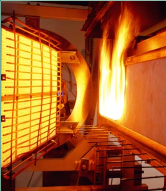
Flame spread testing per Part 5 of Annex 1 of the IMO FTP Code