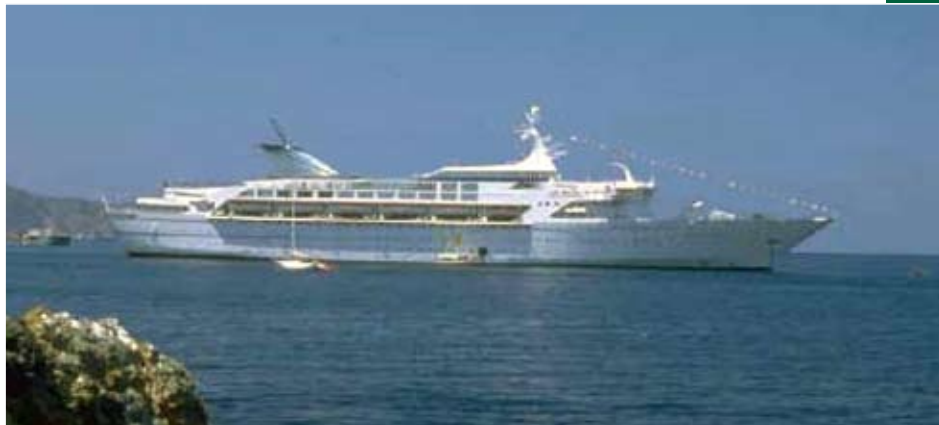
SwRI provides inspection services in support of "type" or "case-by-case" approvals