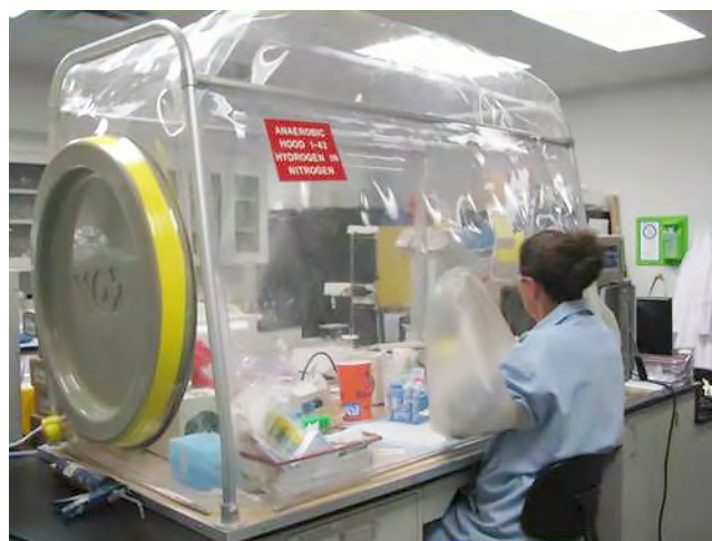
Filter collection of microorganisms present in diesel fuel