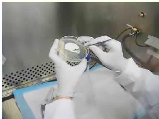
Placement of membrane filter containing microorganisms onto growth medium