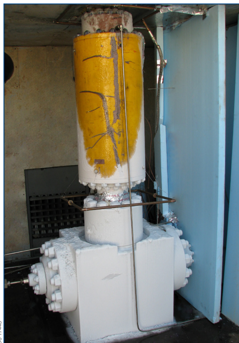
Valve and hydraulic actuator assembly undergoing low-temperature (-50°F) test