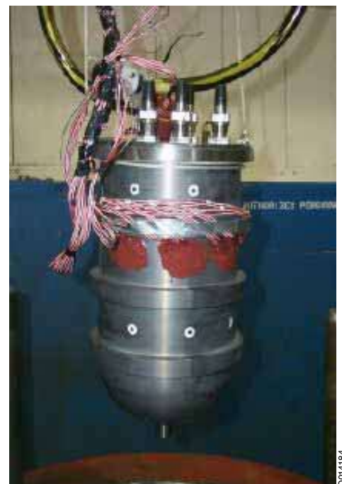
Acrylic pressure hull instrumented for external pressure test