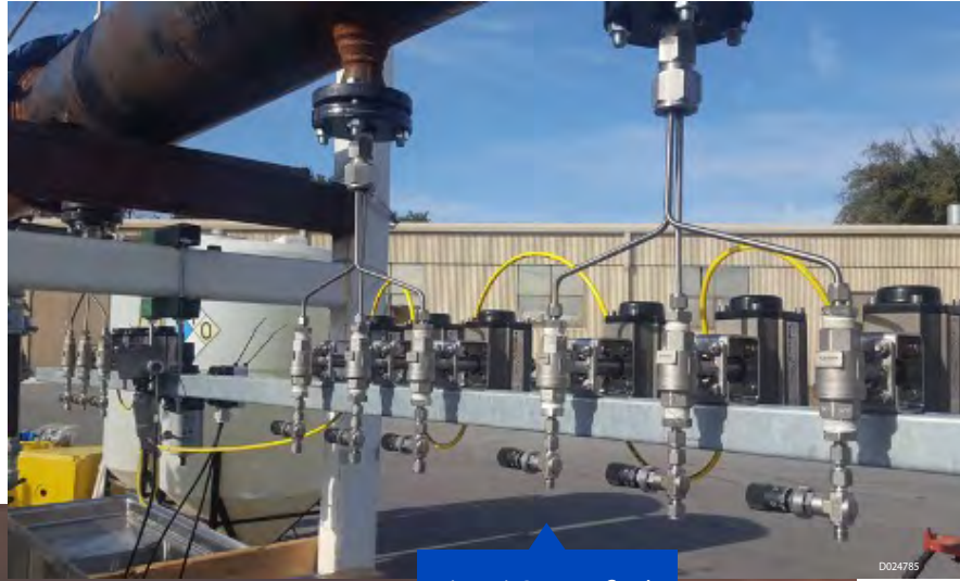
(Inset) Custom fluid sampling section at HVFL developed for a high-viscosity fluid mixing project

SwRI is governed by a confidentiality policy that protects client names, results, and other information obtained in connection with the work performed.