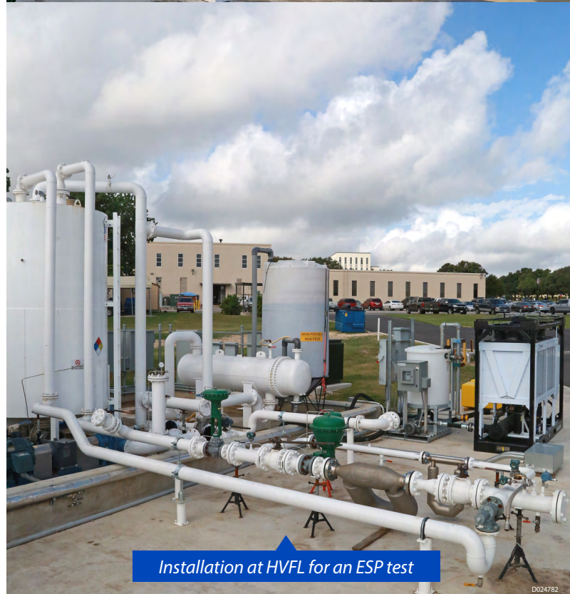
Installation at HVFL for an ESP test