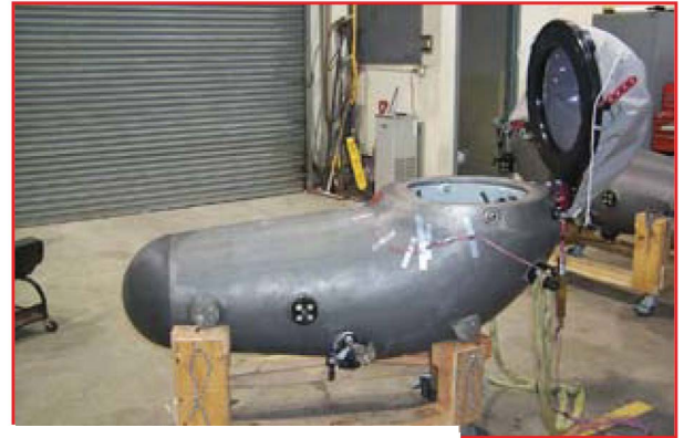
One-man submersible hull instrumented with strain gages for external pressure test to establish maximum depth capability