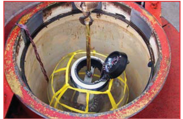
Acrylic pressure hull instrumented for external pressure test