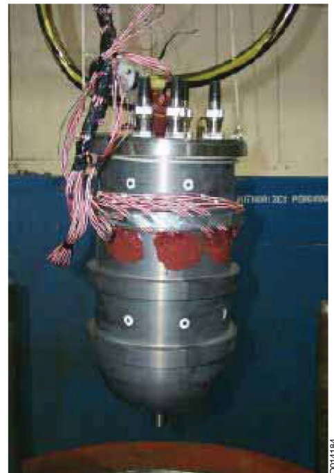
Instrument housing strain gaged prior to proof pressure test