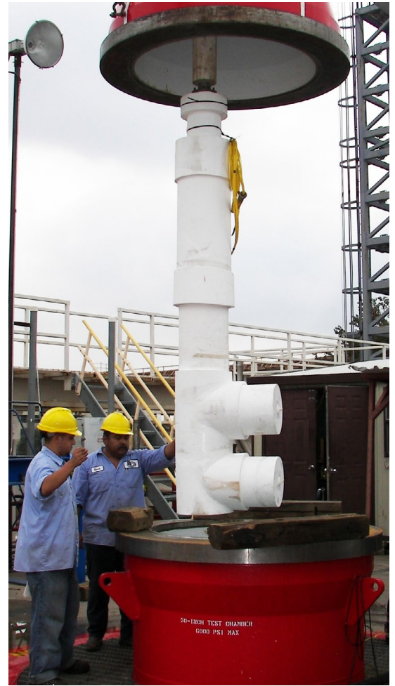
Subsea insulated pipe sample at 10,000-ft depth in 40°F salt water (internal pipe temperature 280°F)

We welcome your inquiries. For more information, please contact: