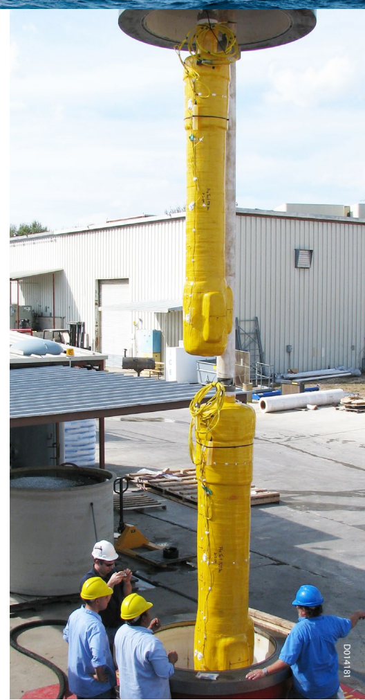
Simulated service insulation test samples being set up for pressure/temperature test