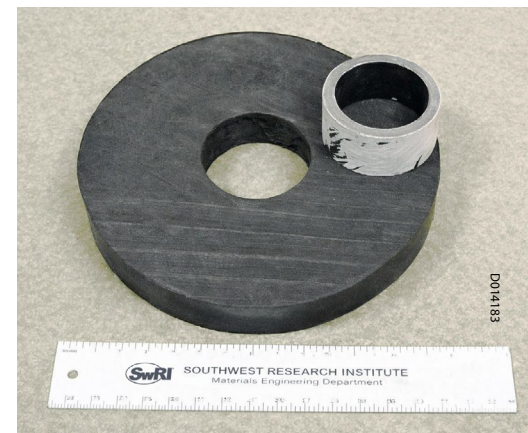
Adhesion strength test on insulation samples to evaluate bonding strength of insulation to steel substrate