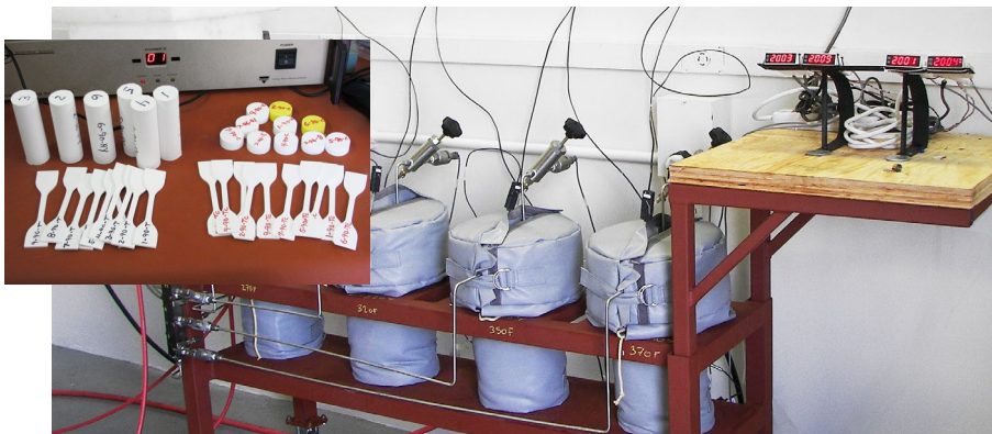
Hydroclave assembly for long-term exposure testing (Inset – Material test samples)