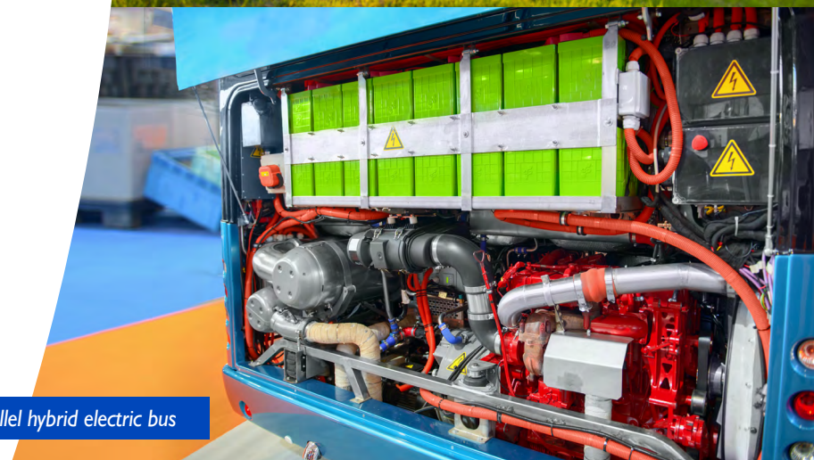
Parallel hybrid electric bus