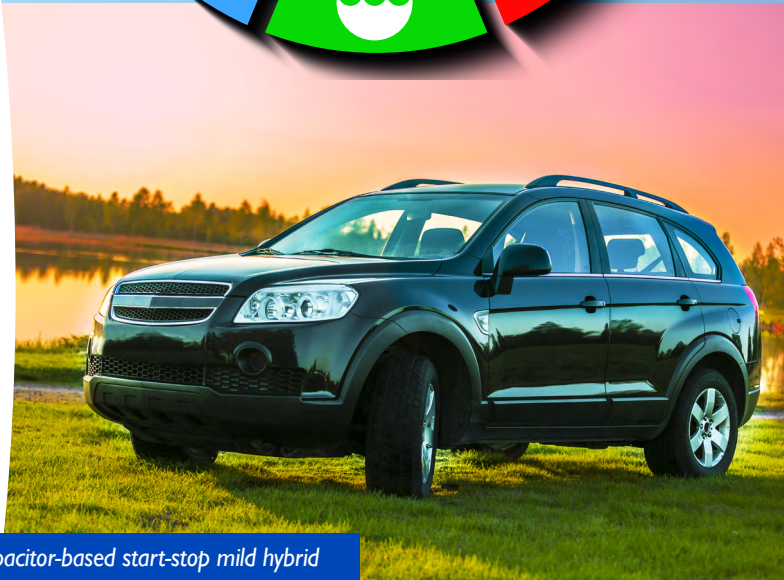
Ultra-capacitor-based start-stop mild hybrid