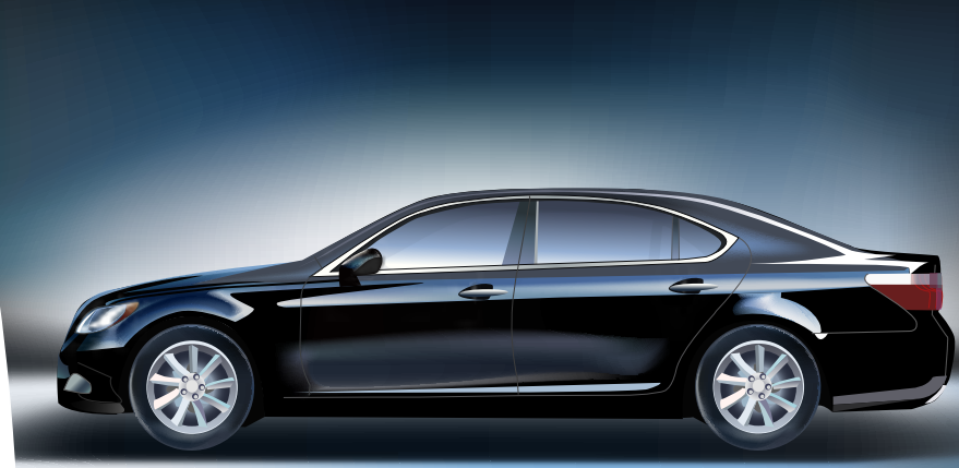
Light-duty hybrid vehicle

SwRI converted a manual transmission to an automated manual transmission (AMT) with a patented actuation and control system to enable building a low-cost parallel hybrid powertrain for a passenger vehicle. The AMT, ISG, battery pack, motor, and controller were integrated with a downsized 1.6 L gasoline engine. The customer mass-produced the converted vehicle.