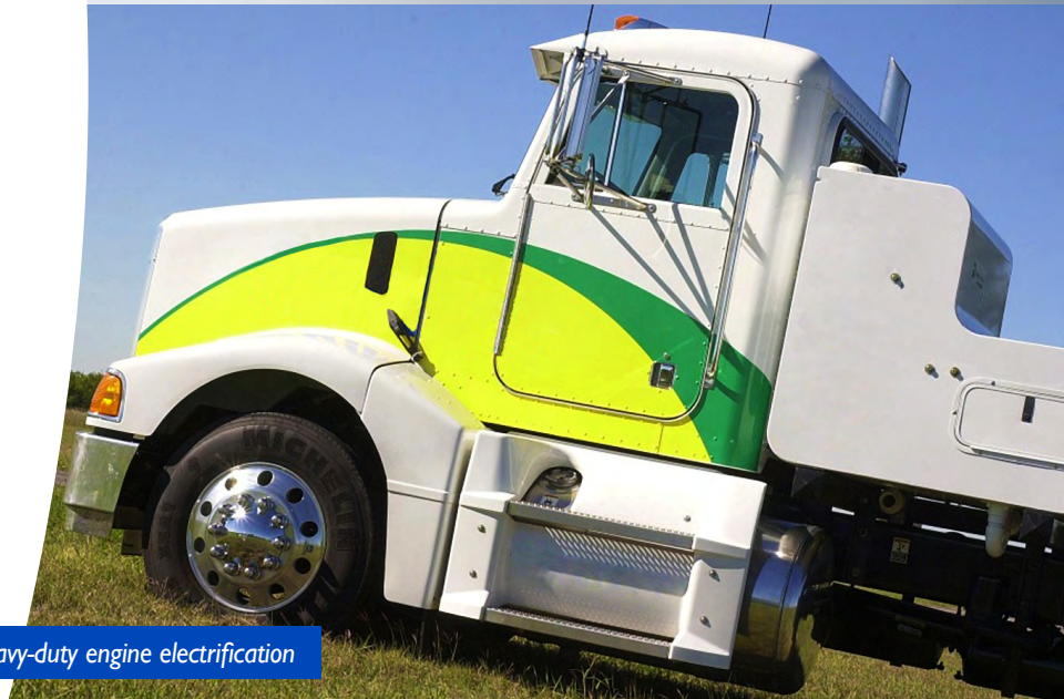
Heavy-duty engine electrification

The fixed belt ratio connections between engine and accessories such as the fan, alternator, air conditioning, and water pump cause loss of energy due to limited controllability. SwRI electrified all these accessories on a 447 kW engine by adding a 42V battery pack charged from two 5 kW fuel cells powered by onboard hydrogen. The average fuel economy improved over a two-year period of road driving by more than 18%.