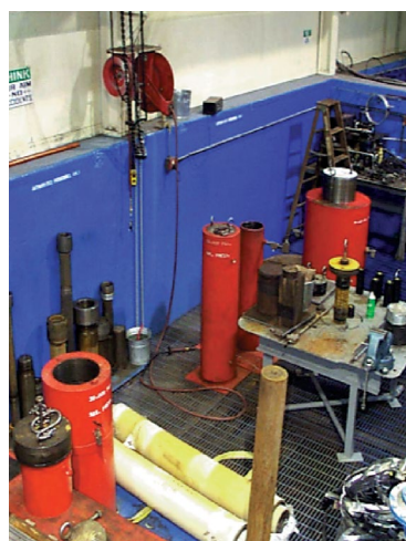
The main pressure laboratory houses more than 10 deep ocean pressure simulation chambers which are used for static, cyclic and destruct testing.