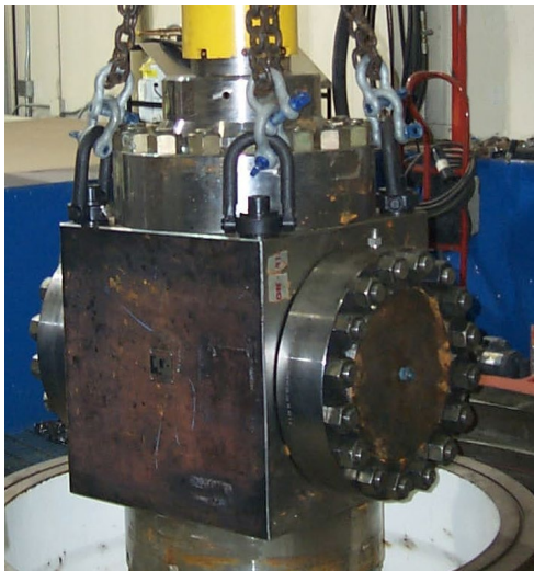
Subsea valve being placed in test chamber