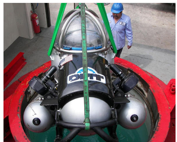
Mini-submarine being tested for ABS recertification