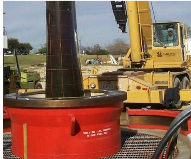
Large-diameter pipe casing after collapse test

We welcome your inquiries. For more information, please contact: