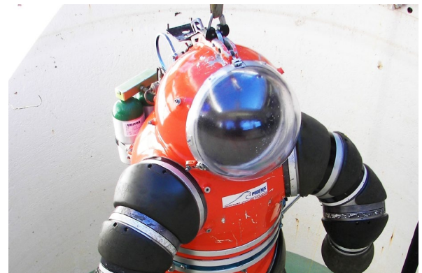
Diving suit subjected to hydrostatic pressure test