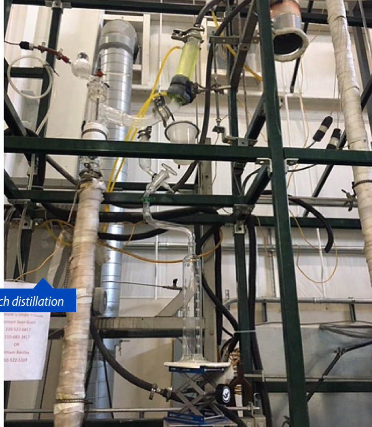
50 L batch distillation