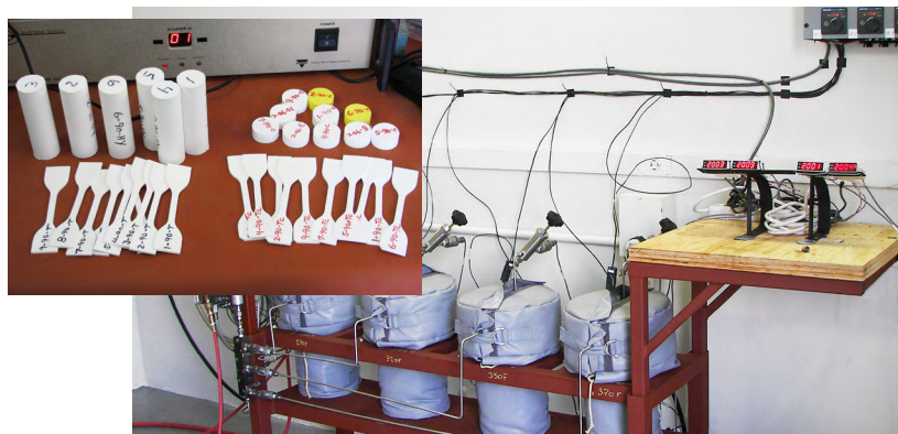
Hydroclave assembly for long-term exposure testing (Inset – Material test samples)