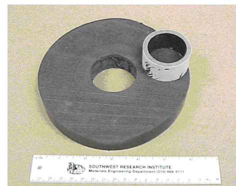
Adhesion strength test on insulation samples to evaluate bonding strength of insulation to steel substrate