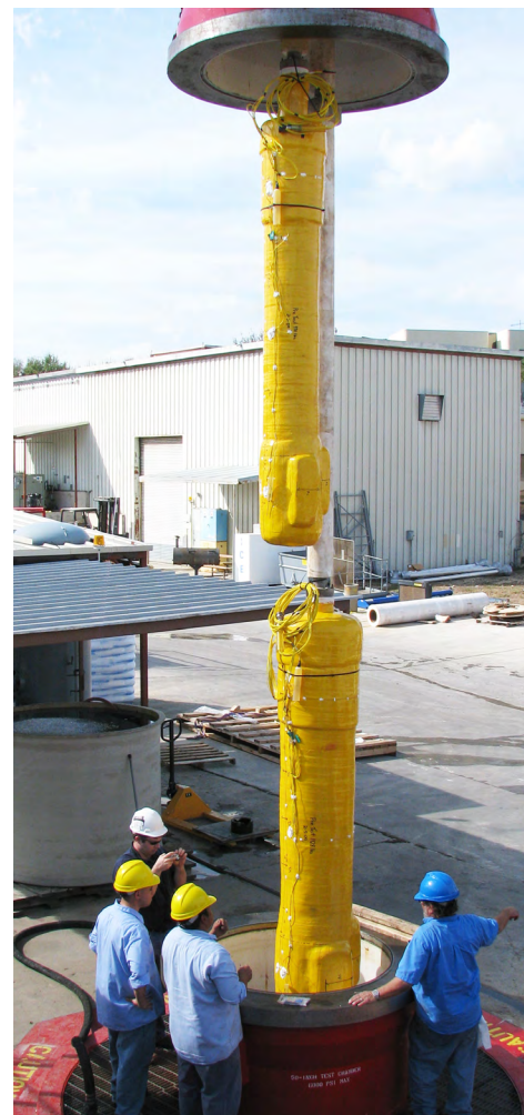
Simulated service insulation test samples being set up for pressure/temperature test