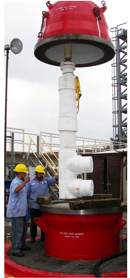
Subsea insulated pipe sample at 10,000-ft depth in 40°F salt water (internal pipe temperature 280°F)

We welcome your inquiries. For more information, please contact: