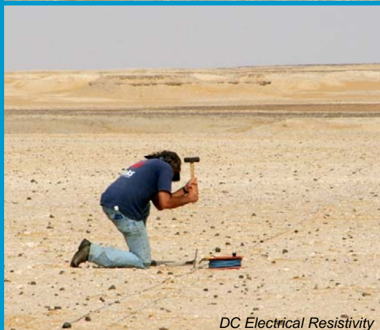
DC Electrical Resistivity