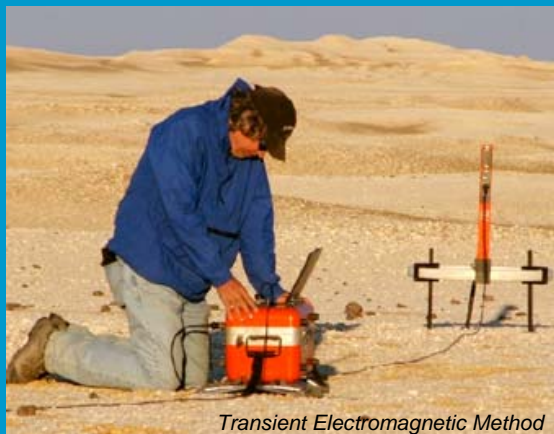
Transient Electromagnetic Method